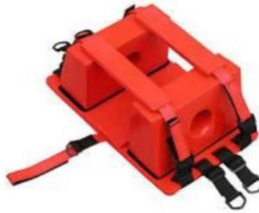
HEAD IMMOBILIZER (Adult & Child)