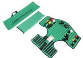
KED EXTRICATION DEVICE