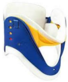
CERVICAL COLLAR (Adult & Child)