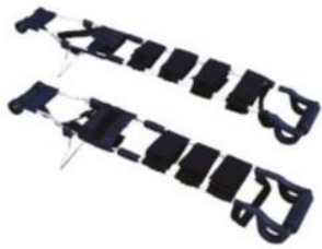
TRACTION SPLINT (Adult & Child)