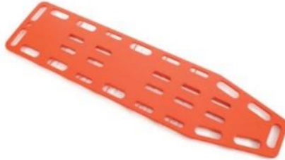
S2 SPINAL BOARD